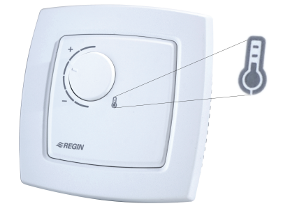
Fig. 1 Temperature indication

The controller has a LED shaped as a thermometer on its front. A red light indicates heating control is active and a blue light indicates active cooling control. If the LED is switched off, it means neither heating or cooling control is active.